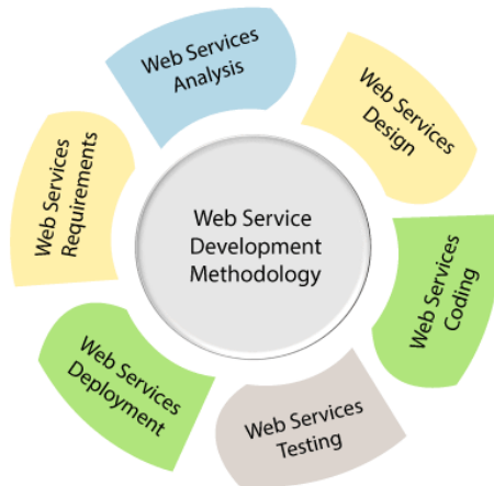
Figure 1. Web Service Implementation Lifecycle

The life cycle of a web service implementation as shown in Figure 1 are :